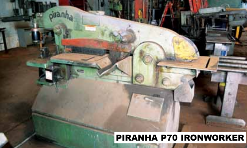
PIRANHA P70 IRONWORKER