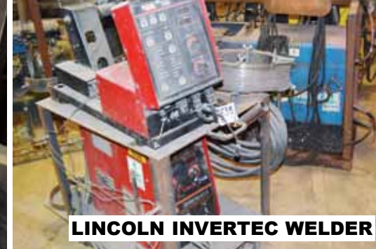
LINCOLN INVERTEC WELDER