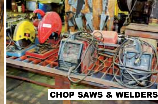
CHOP SAWS & WELDERS