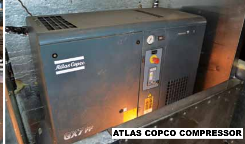
ATLAS COPCO COMPRESSOR