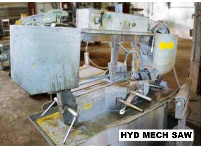
HYD MECH SAW