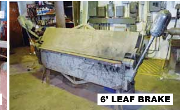
6' LEAF BRAKE

Forklifts – Hyster H80XL 8,000 lb. LPG forklift 169" lift, side shift, Monotrol transmission s/nF005DD5069M • Clark forklift (parts only)