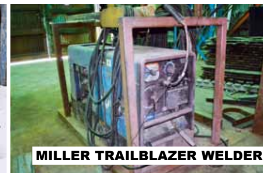
MILLER TRAILBLAZER WELDER