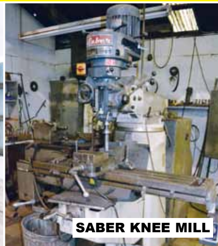
SABER KNEE MILL